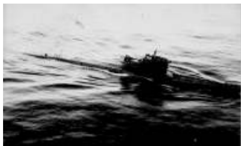
U-boat L-75 surrenders on 11th May 1945

were expected to accept responsibility for ourselves and the lives of our crews. The end came quite suddenly. At 1500 hours on 4 May, 1945, Admiral Doenitz broadcast instructions to U-boat commanders to cease fire. On 8 May, all U-boats were ordered by the Admiralty to surface, fly a black flag, report position and proceed to specified ports. The first surrenders began on 9 May, and others followed in the next few days.