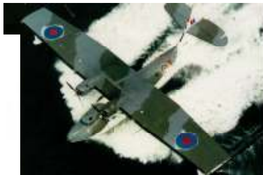
Actually it's 210 Squadron's