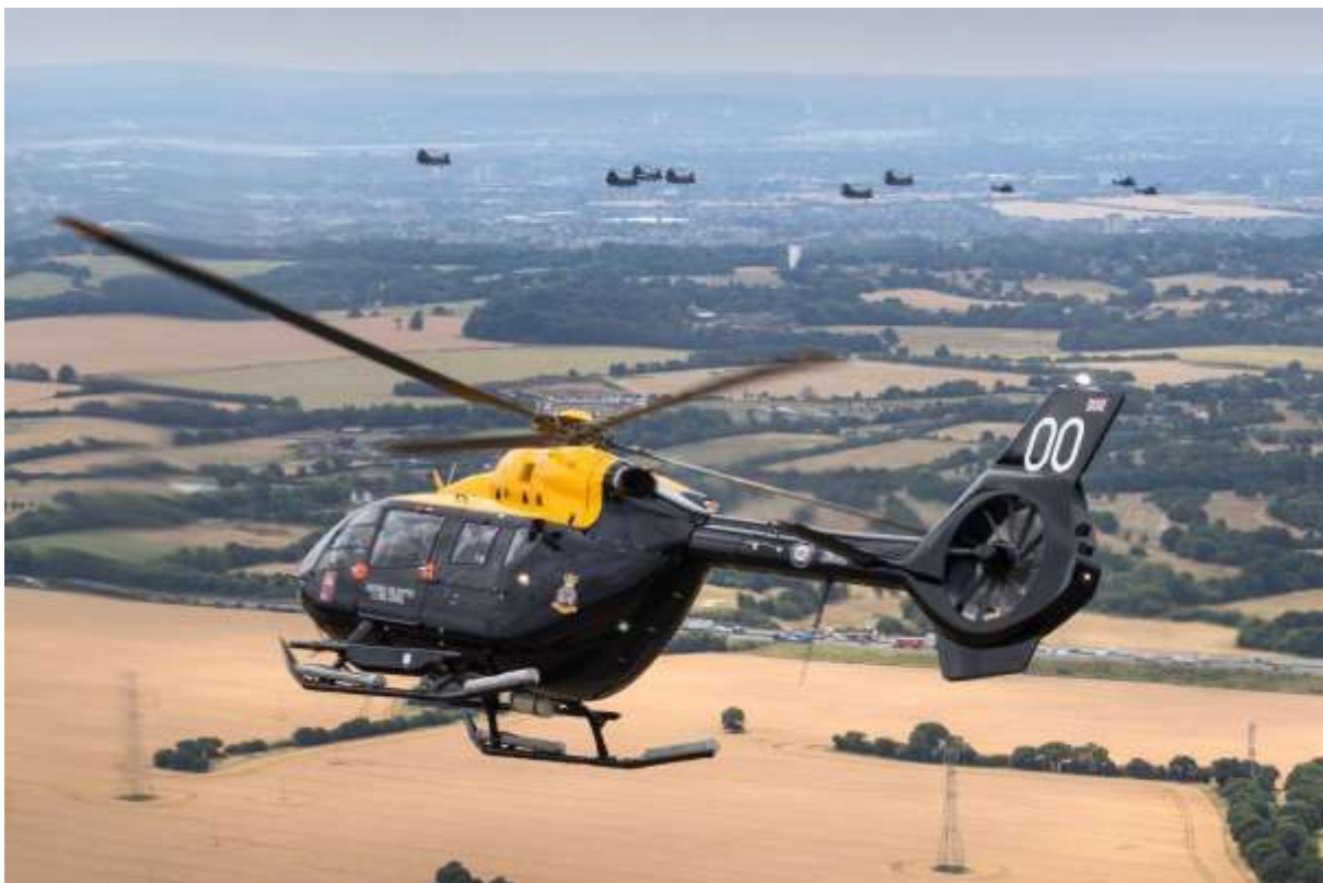
202 Sqn Jupiter HT1 positioning for RAF100 flypast, 11 th July 2018

The newsletter of the 202 Squadron Association